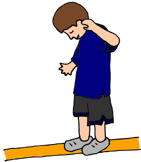
Balance Beam forward and Back