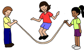
Twirl Rope catch with Toes