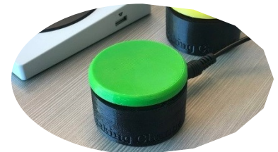
3D printed Makers Making Change (MMC) 60 mm Round Switch