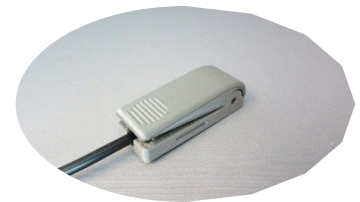
3D printed Makers Making Change (MMC) Light Touch Switch

Once completed, equipment will be picked up by: